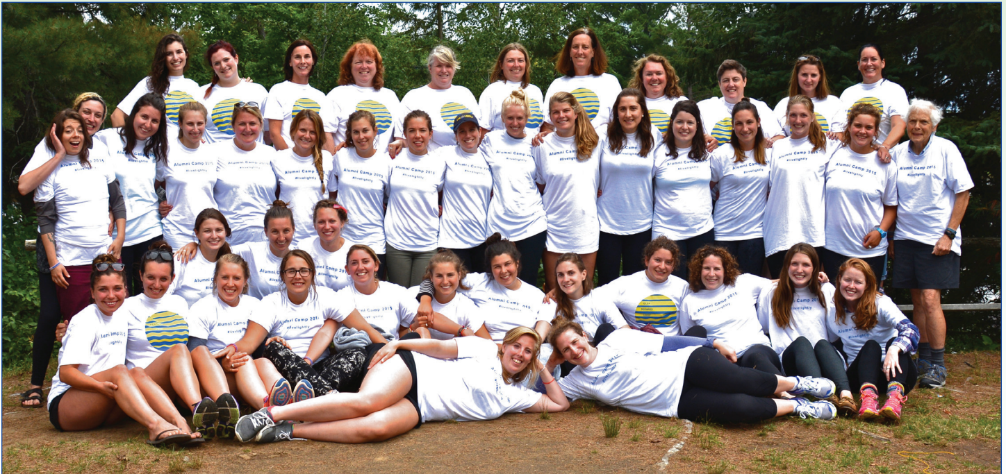
Alumni campers group shot!