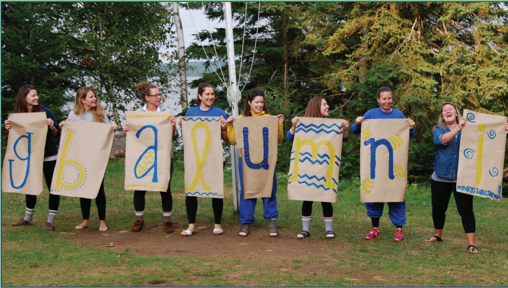
Alumni flagraising - didn't miss a beat!

The alumni campers descended on GBC on August 27th, 2015 with a level of enthusiasm that set the stage for the whole weekend.