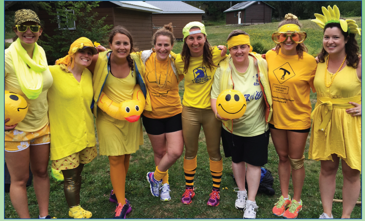
The Yellow team was victorious at the first ever Alumni Colour Relay.

It didn't take but a minute for each and every "camper" to fall back into the GBC way of life. Between the jungle, zipper, crafts, canoeing, sailing, swimming, Eskimo rolls, campfire, singing, nighttime Hoards and most notably the Alumni Colour Relay (yellow won by the way), their GBC spirit shone through! We concluded our amazing weekend with Vista where it was very clear the impact that camp has had on each of us. Thank you to all who attended. We loved welcoming you back home!