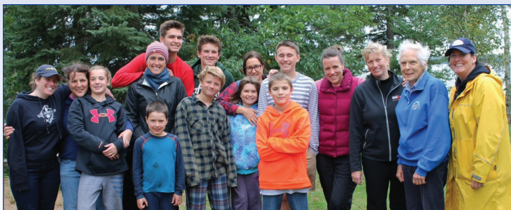
A group shot upon departure. See you all soon!

This fabulous weekend is growing in popularity and we couldn't be happier! Join us on the shores of Lake Bernard with your family and celebrate 95 years of being under open skies!