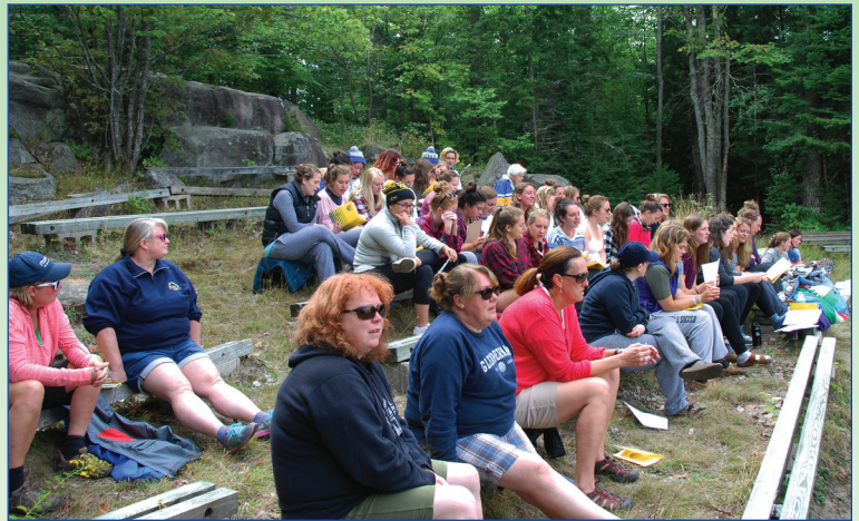
Sunday morning Vista was a highlight of the weekend