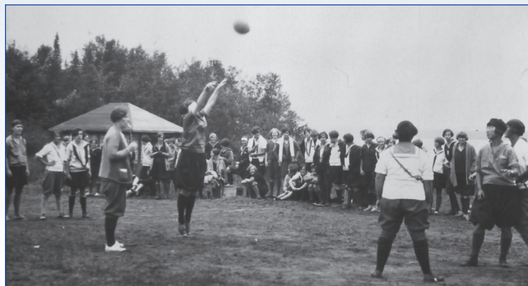
Campers playing basketball circa 1940

This 95th season offers GBC the chance to share the very unique opportunity to be exposed to the fascinating Canadian