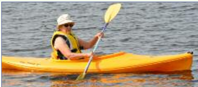
Perfect weather for kayaking!