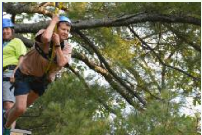
Leaping off the zipper!