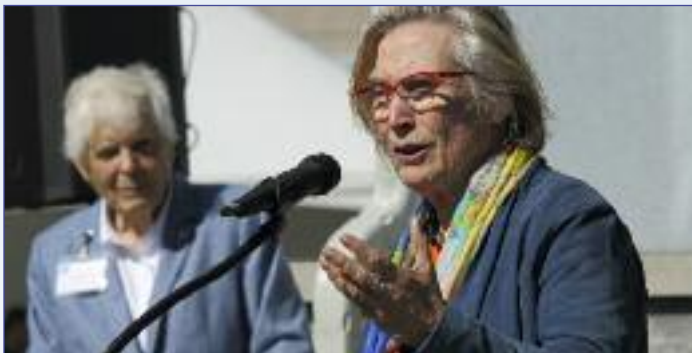
Carolyn Bennett addresses the attendees at the ribbon cutting ceremony

We were pleased to have The Honourable Carolyn Bennett P.C., M.P., Minister of Crown-Indigenous Relations and Northern Affairs, with us for this day of celebration. Carolyn brings her life skills as a camper, teacher, physician, planner and champion