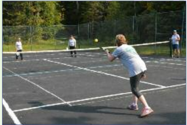
The Divas learn how to play Pickle Ball!

If you haven't attended Women's Weekend before, consider being warmly welcomed into this fabulous group of women and join the fun in 2018!