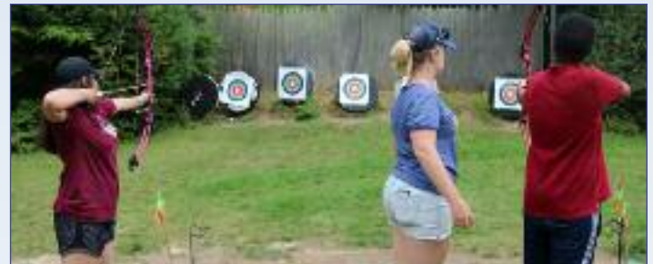
For many, this was their first try at archery!

As GBCers, we felt very grateful to have spent time getting to know each of the Cambrian College students. Their connection to GBC was apparent when we visited Cambrian in September and were warmly received. Opening Glen Bernard to as many people