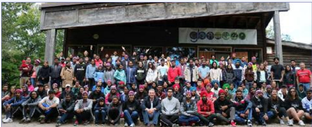
Students and Cambrian staff take a great group photo!