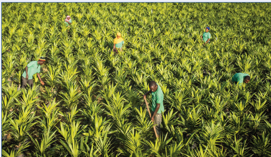
Farmers hard at work tending to crops